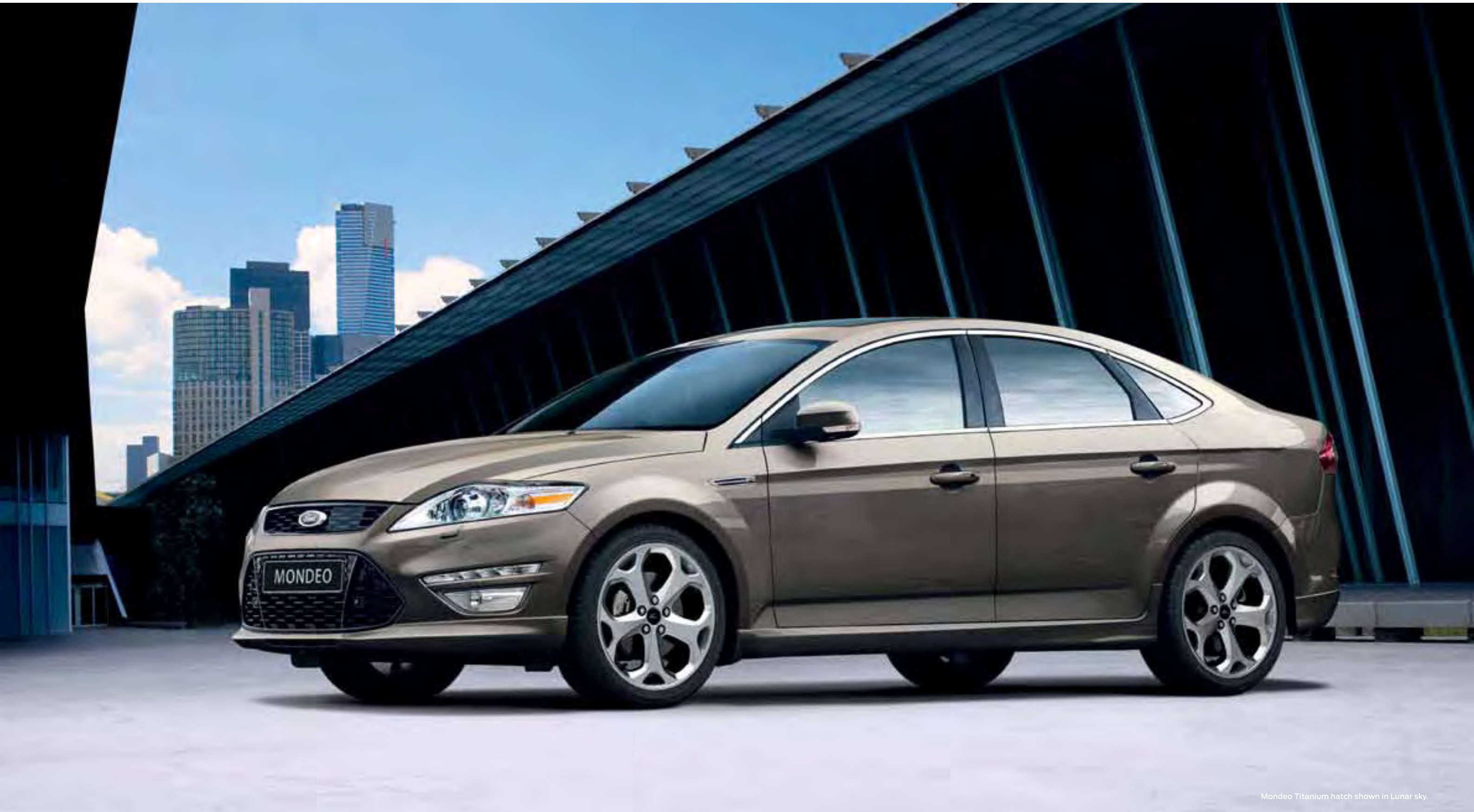
Mondeo Titanium hatch shown in Lunar sky.

Some designs are blessed with a unique talent to stand out from the pack. Introducing the new Ford Mondeo.