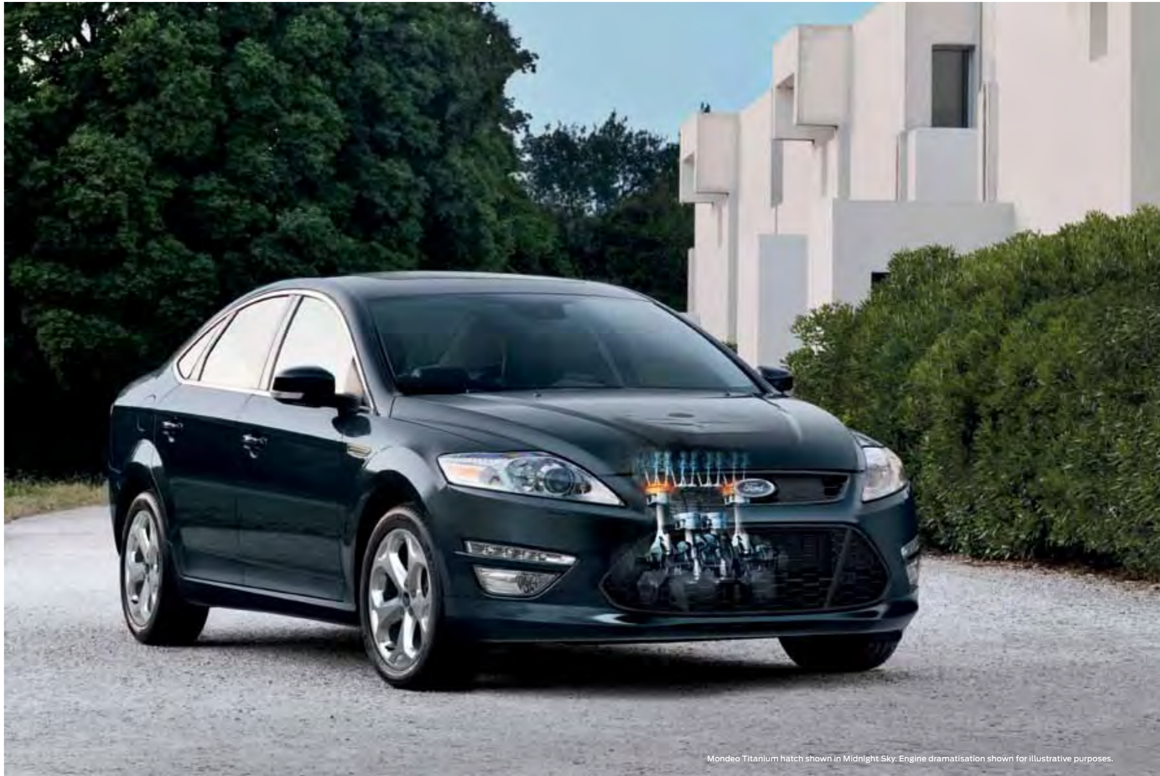
Mondeo Titanium hatch shown in Midnight Sky. Engine dramatisation shown for illustrative purposes.

Continually assesses the effect of your driving behaviour on fuel consumption - including speed, gear shifting and anticipation levels, plus your ratio of short trips. Smart software then provides useful advice on achieving better fuel economy according to your driving style.