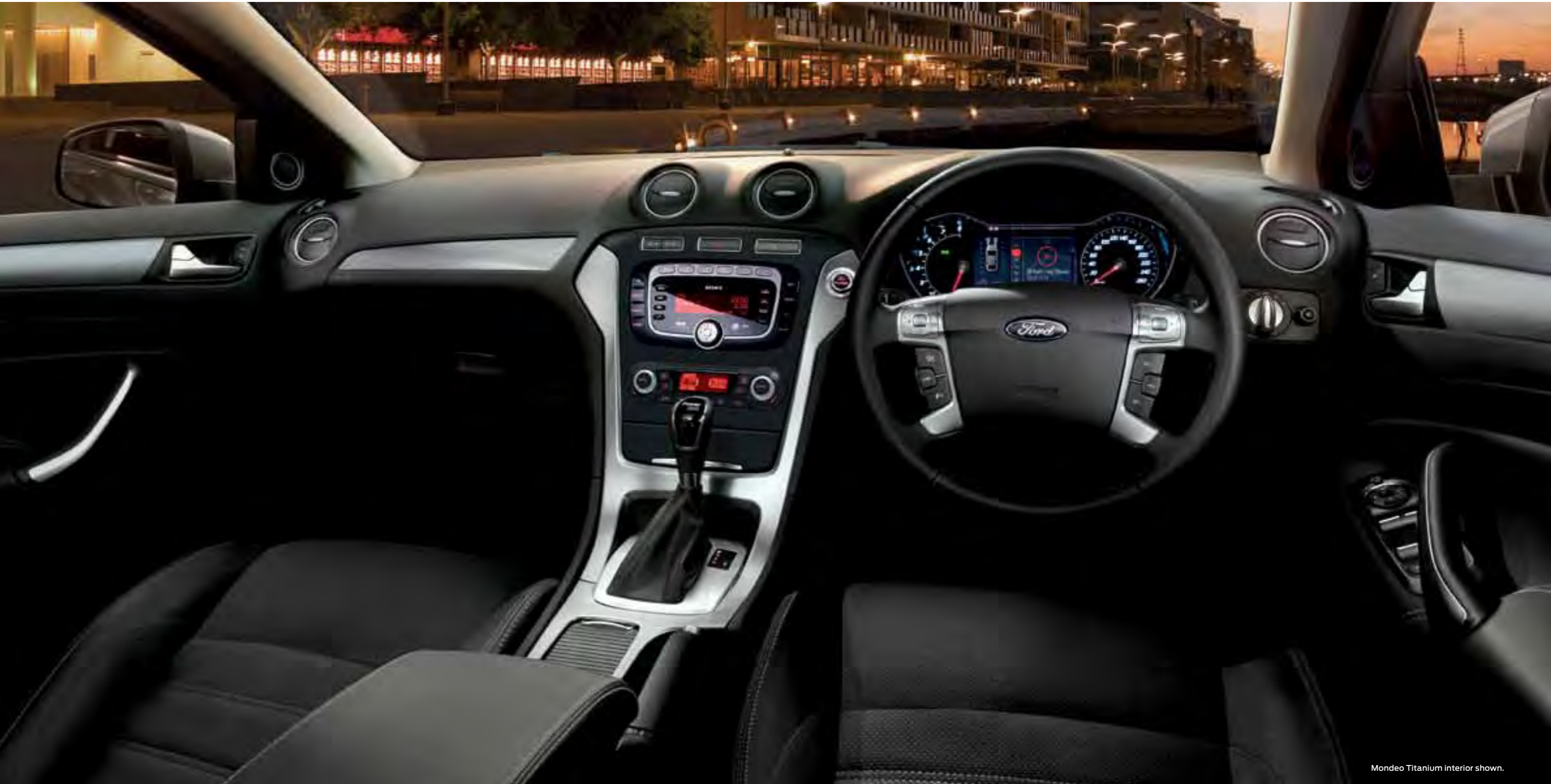
Mondeo Titanium interior shown.

A car that can detect when you're drowsy* and that allows you to make phone calls without lifting your hands off the steering wheel are just some of the features that ensures your experience behind the wheel of the Mondeo is everything the exterior design promises.