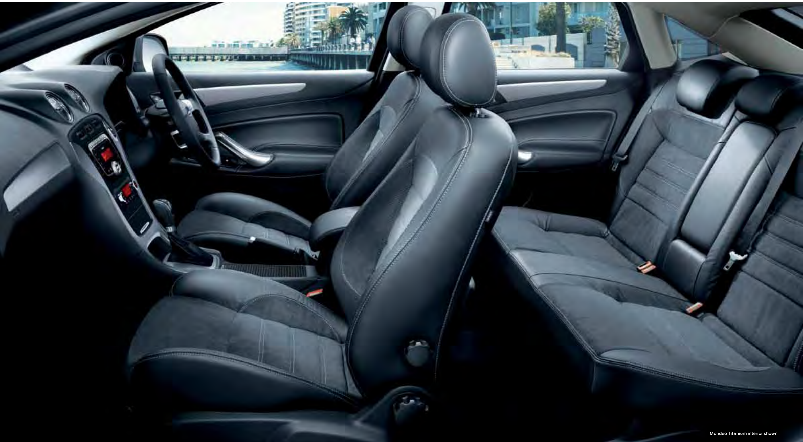
Mondeo Titanium interior shown.

Featuring Alcantara leather-trim seats, the Mondeo Titanium allows both driver and passengers to sit back and experience first class comfort and luxury.