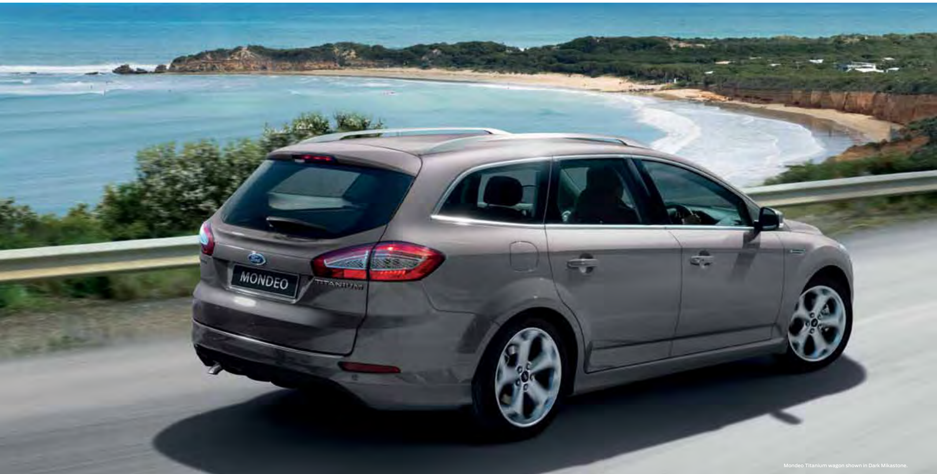
Mondeo Titanium wagon shown in Dark Mikastone.

For those who pack more into life you'll be pleased to know the Mondeo range gives you a vehicle that gives you the flexibility to pack more of whatever you need.