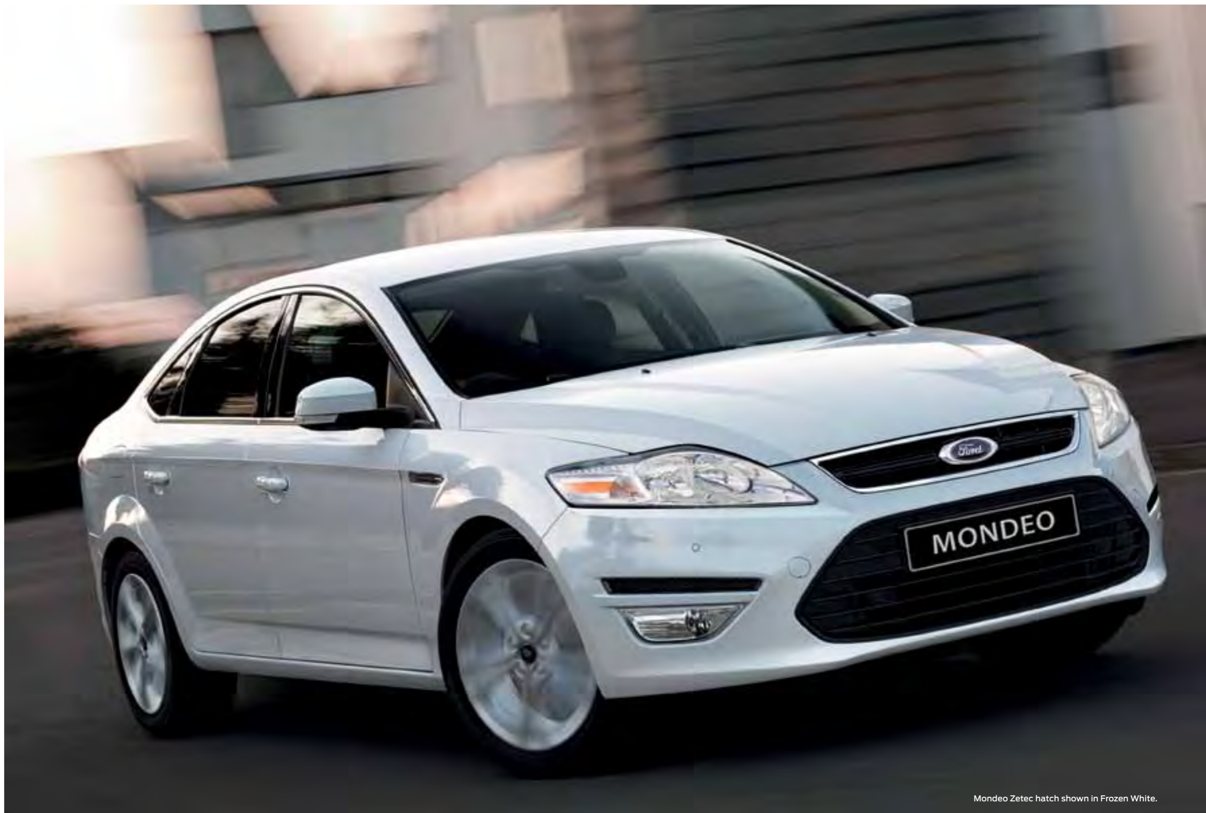
Mondeo Zetec hatch shown in Frozen White.

Cruise control that automatically 'adapts' the car's speed to keep your chosen distance from the car in front. Should the car in front slow down, your speed drops. When traffic speeds up, you automatically return to your cruising speed.