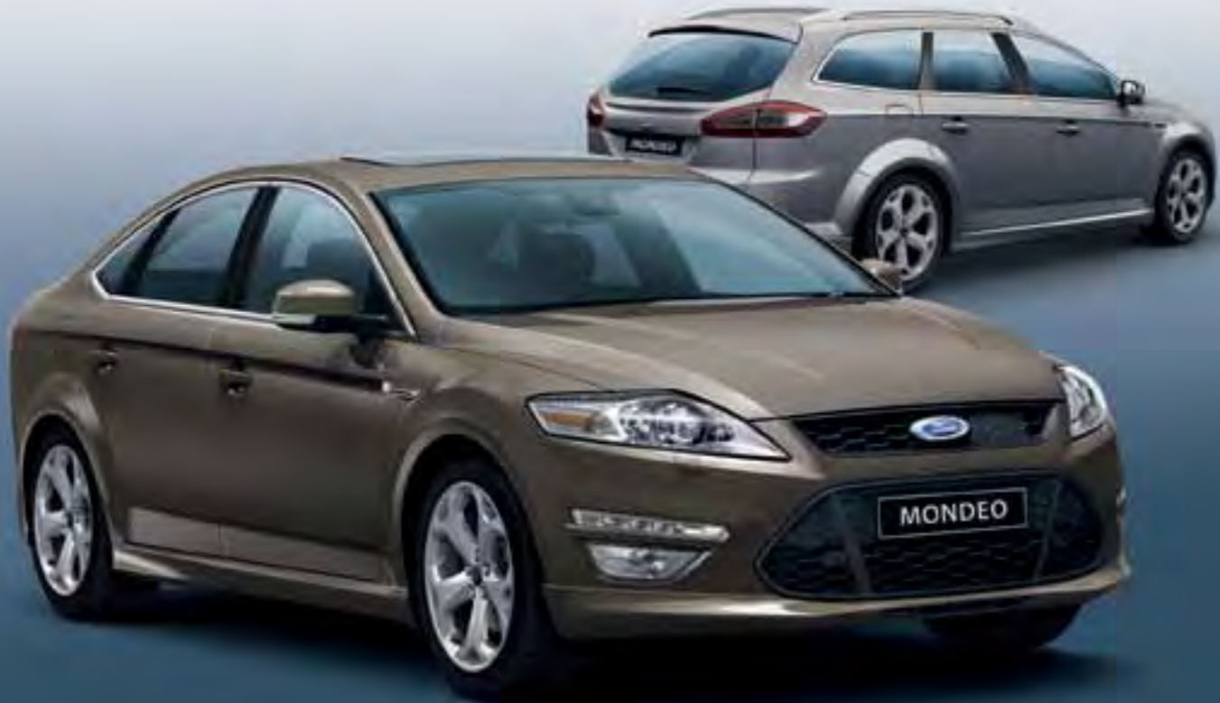
Sedan shown in Lunar Sky, wagon shown in Dark Mikastone.