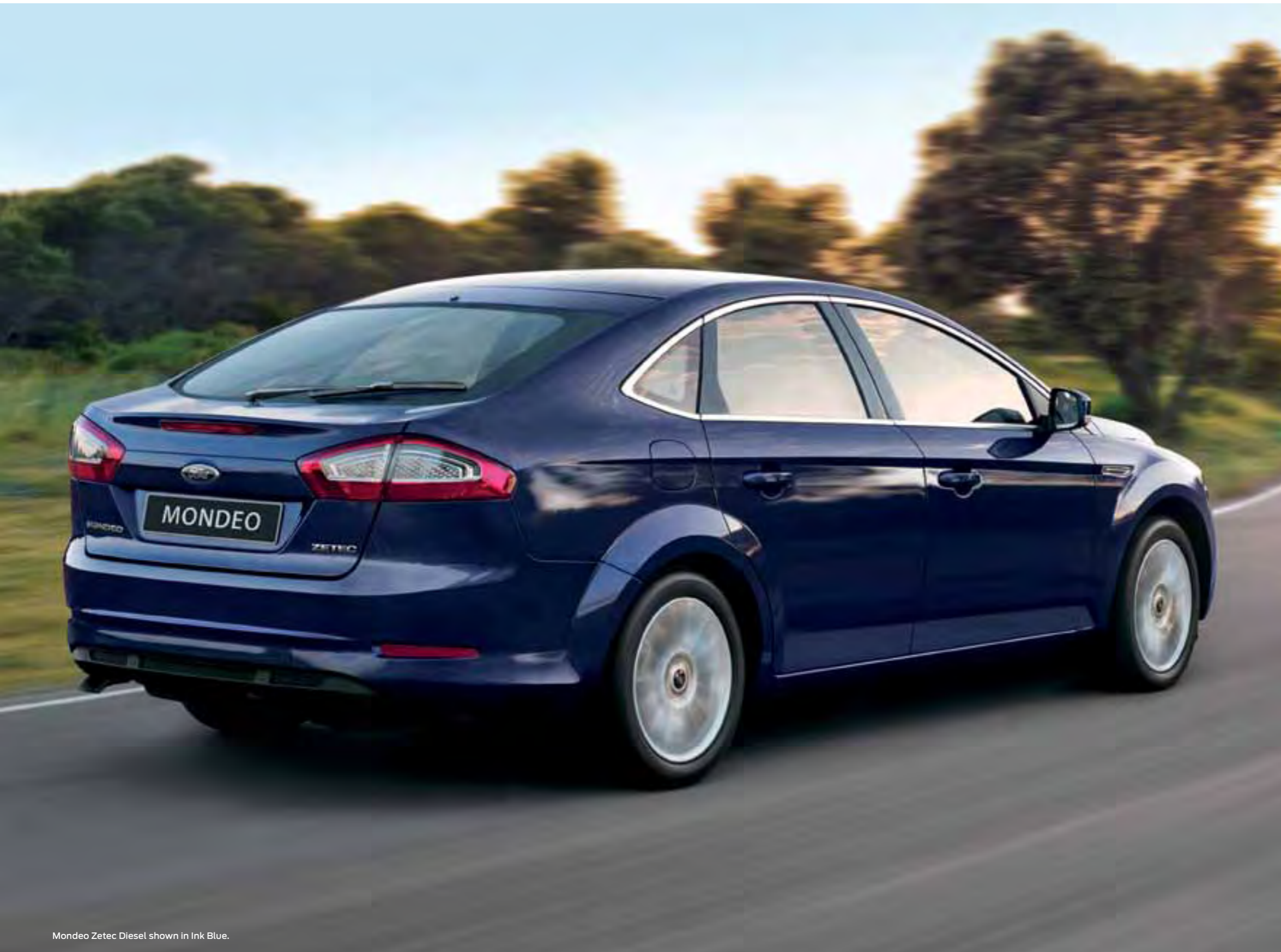
Mondeo Zetec Diesel shown in Ink Blue.

A great car is just the beginning. We support you with a wide range of services that aim to make you one of the most satisfied vehicle owners in Australia.