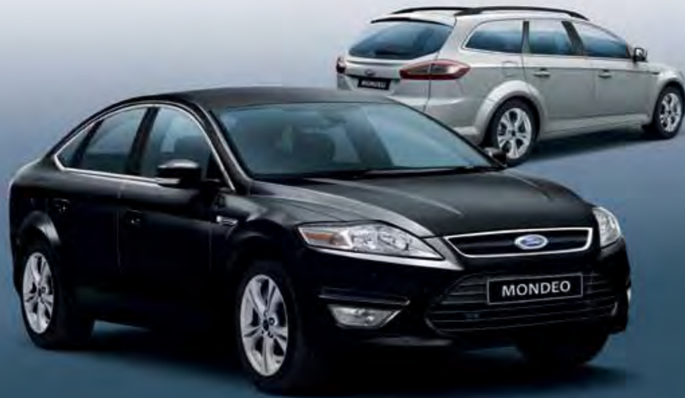
Sedan shown in Panther Black, wagon shown in Moondust Silver.