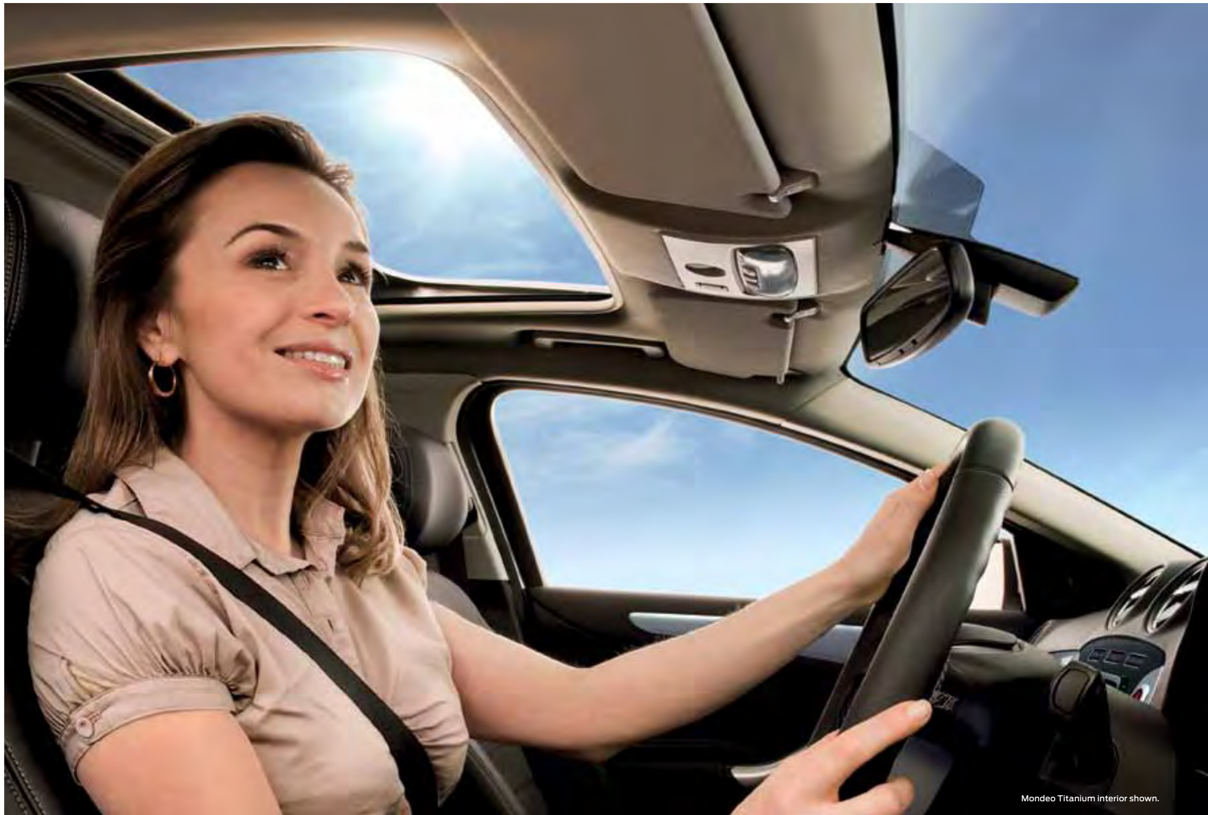
Mondeo Titanium interior shown.

Standard across the entire Mondeo range, imagine having a whole selection of your vehicle's functions and operations at your control simply by voicing a command. From controlling the vehicle's interior climate temperature to safely making hands-free calls on the move.