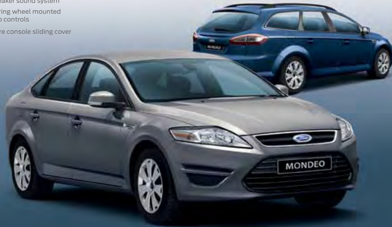
Sedan shown in Dark Mikastone, wagon shown in Ink Blue.